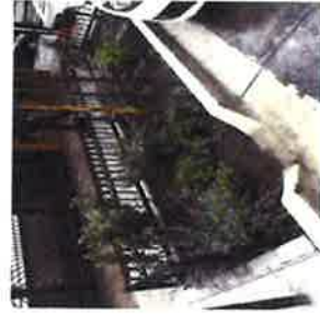
Clearance of at least 1' from trees, branches, and plant beds