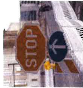
Keep sidewalk café structures away from all street signs