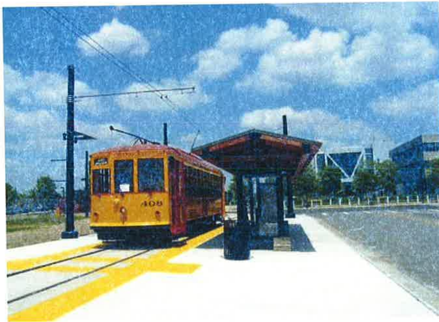
A bus transit lane can also support trolley service: