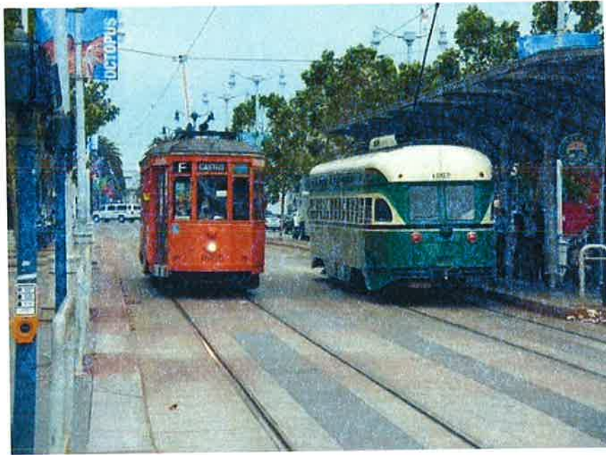
Passing (runaround) track, roadside reservation. In long stretches of single track, consider using passing tracks to increase line capacity: