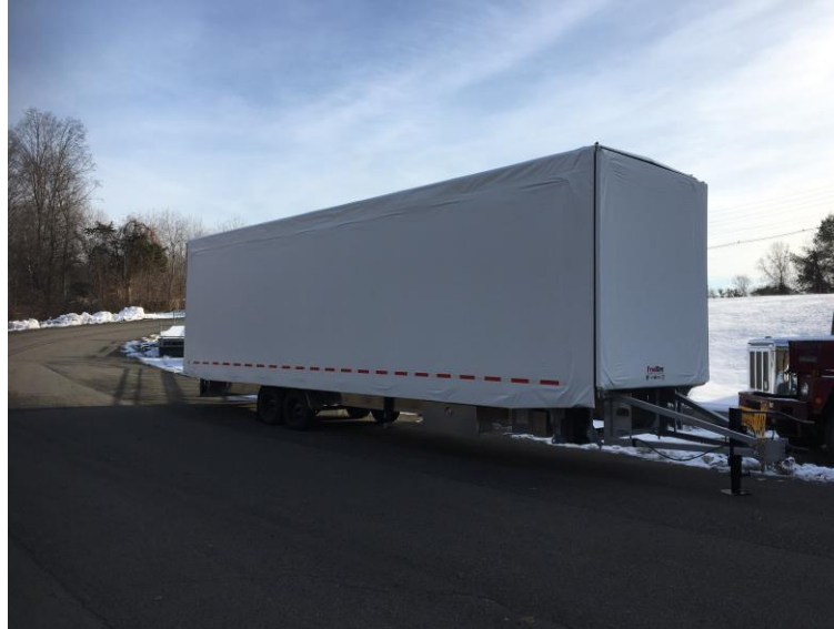
Figure 8: Kingston's new community mobile stage