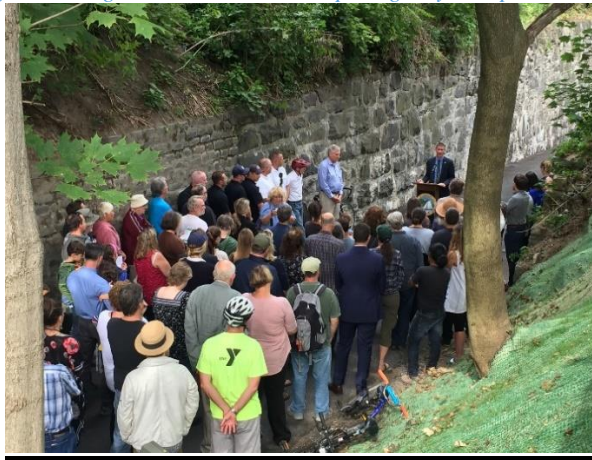
Figure 1: Kingston Point Rail Trail Opening Day in September 2019