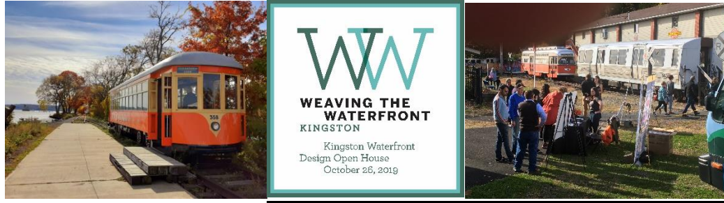
Figure 6: Photos from Weaving the Waterfront in on October 26, 2019