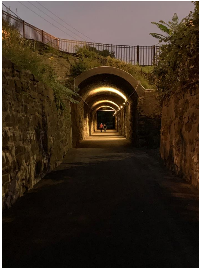
A fall evening at the tunnel of the Kingston Point Rail Trail that opened in September 2019.