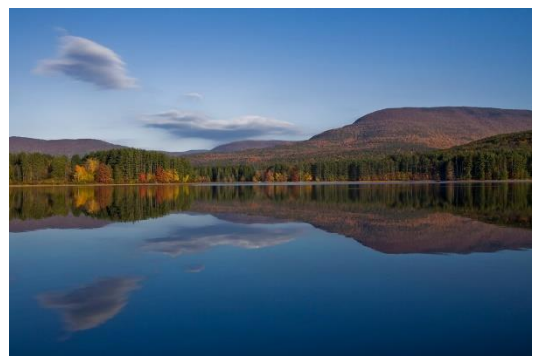
Cooper Lake Reservoir

Kingston gets its water from a Catskill stream. From there, it is piped into our Cooper Lake Reservoir. From the Reservoir, water flows by gravity through a transmission main to our Edmund T. Cloonan Water Treatment Plant. The NYS DOH conducted source water assessments for Cooper Lake and our emergency sources (Reservoirs 1, 2, and 4). These assessments evaluate the possible and actual threats to our sources and, although it includes a susceptibility rating which estimates the risk posed by each potential source of contamination, it does not mean that the water delivered to consumers is, or will become contaminated. The NYS DOH has found that Cooper Lake contains no discrete potential contaminant sources, and the land cover contaminant prevalence ratings are low. The NYS DOH has not conducted a source water assessment for the Mink Hollow stream which is our principal source of supply. Those assessments that have been completed are available for inspection by calling the Water Department at 845-331-0175.