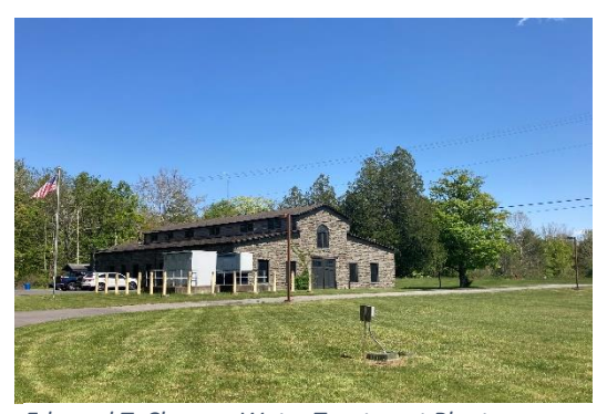
Edmund T. Cloonan Water Treatment Plant

The treatment technologies that are employed by the Kingston Water Department include chlorine disinfection, direct filtration with alum coagulation, corrosion control via the addition of lime and ultraviolet disinfection. The treatment facilities have nominal capacities of 8 MGD.