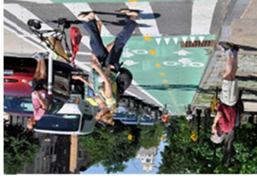
Adjusting lane configuration can create new opportunities for Broadway, including new green space, sidewalks, pedestrian safety measures, and even bike lanes.

Attend the meeting to see for yourself how we can improve traffic flow, reduce conflict and increase safety.